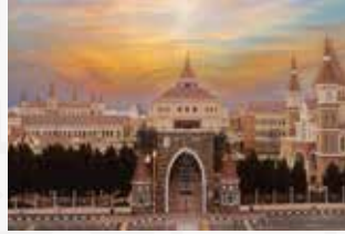
Repton School Nad Al Sheba