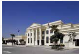
Repton School Al Barsha